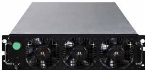
The 93PR 25kW UPM (Uninterruptible Power Module)

The 93PR still offers the highest double conversion efficiency in the market, reaching above 96%.