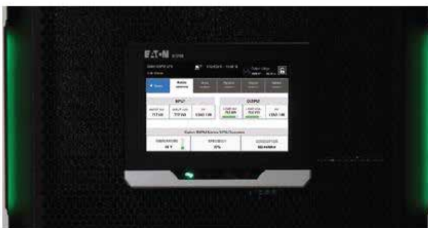
Green light bars showing healthy UPS.