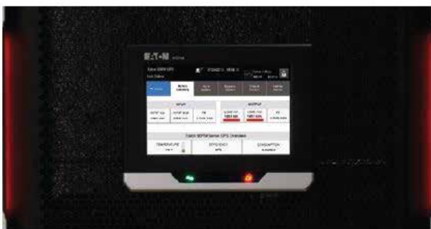
Red light bars showing alerts on system. Yellow light bars indicate battery and bypass status.